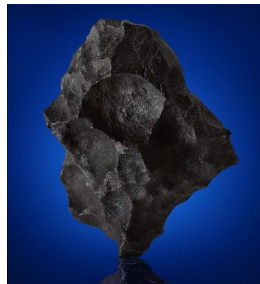
GIBEON METEORITE — NATURAL EXOTIC SCULPTURE FROM OUTER SPACE Estimate: $15,000 – 25,000 (No Reserve)