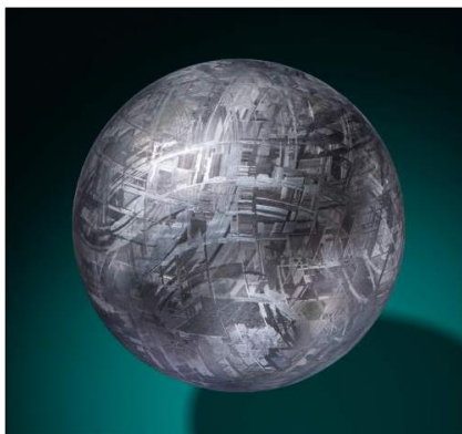
MUONIONALUSTA METEORITE CRYSTAL BALL — CRYSTALLINE STRUCTURE OF AN IRON METEORITE DRAMATIZED IN THREE DIMENSIONS Estimate: $14,000 – 18,000 (No Reserve)