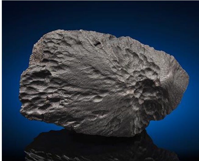
SPECTACULAR ORIENTED STONE METEORITE Estimate: $50,000 – 80,000 (No Reserve)

Online Bidding 9-23 February 72 Lots Offered at No Reserve